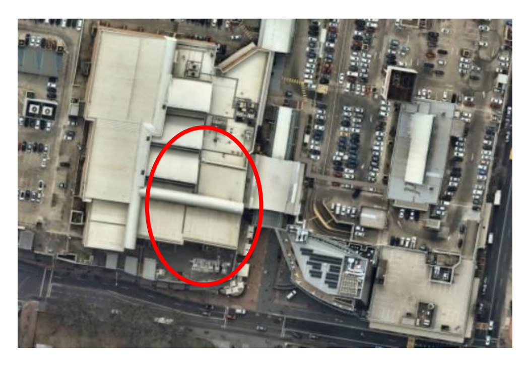
Aerial view identifying the location of the proposed building and other alterations to the Westfield Centre. To the immediate right of the entry is the recently completed medium rise commercial building now occupied by Western Sydney University.