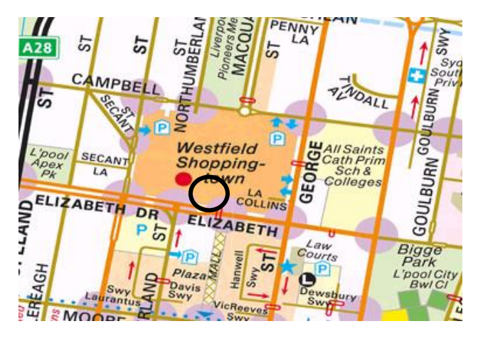
Figure 1 Location map showing the subject site with a black circle

The subject site is located on the western side of the continuation of Macquarie Mall towards the north, on the north side of Elizabeth Street. It forms the part of the main entrance to Westfield Mall from the Macquarie Street Mall.