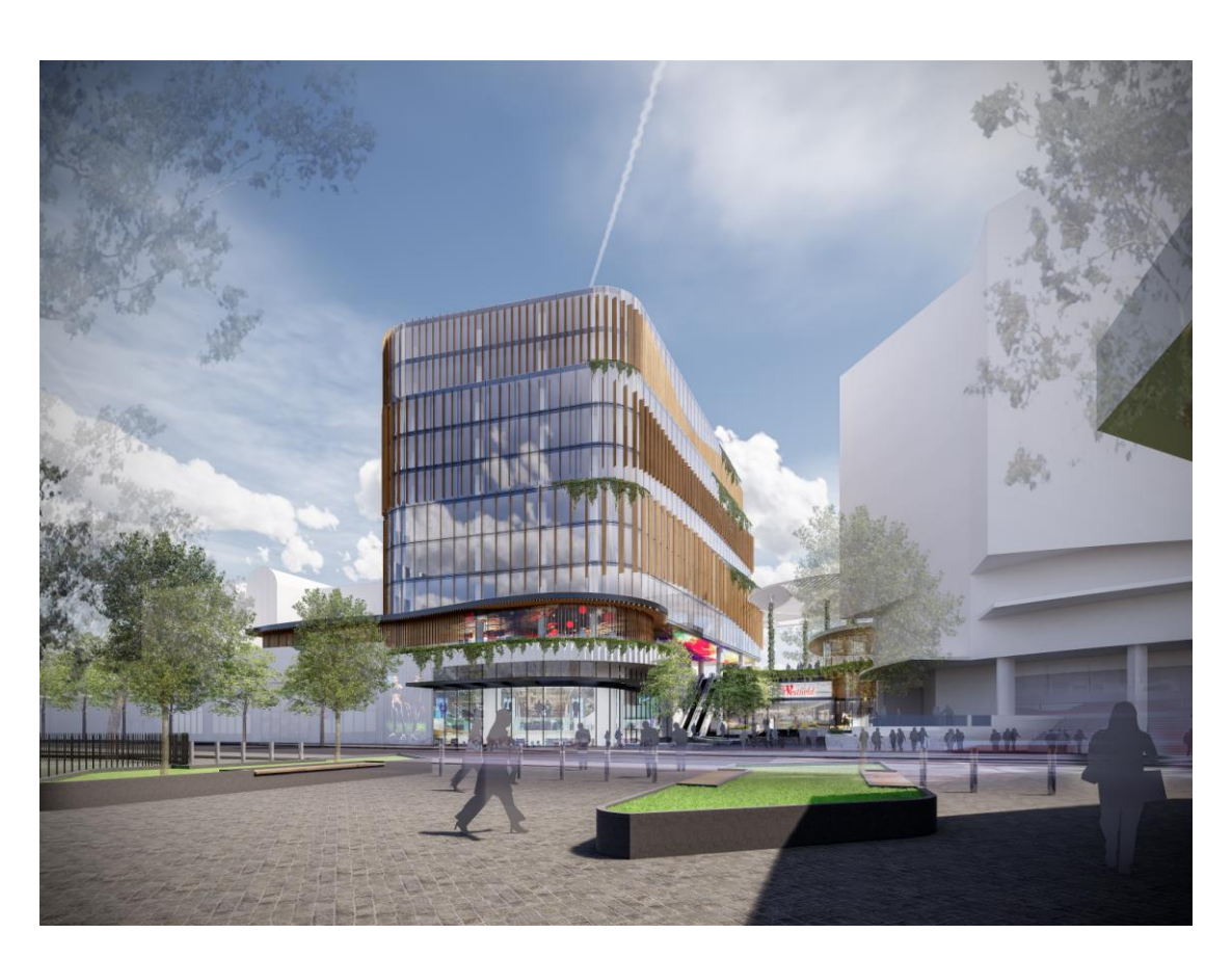
Perspective sketch of the proposed design