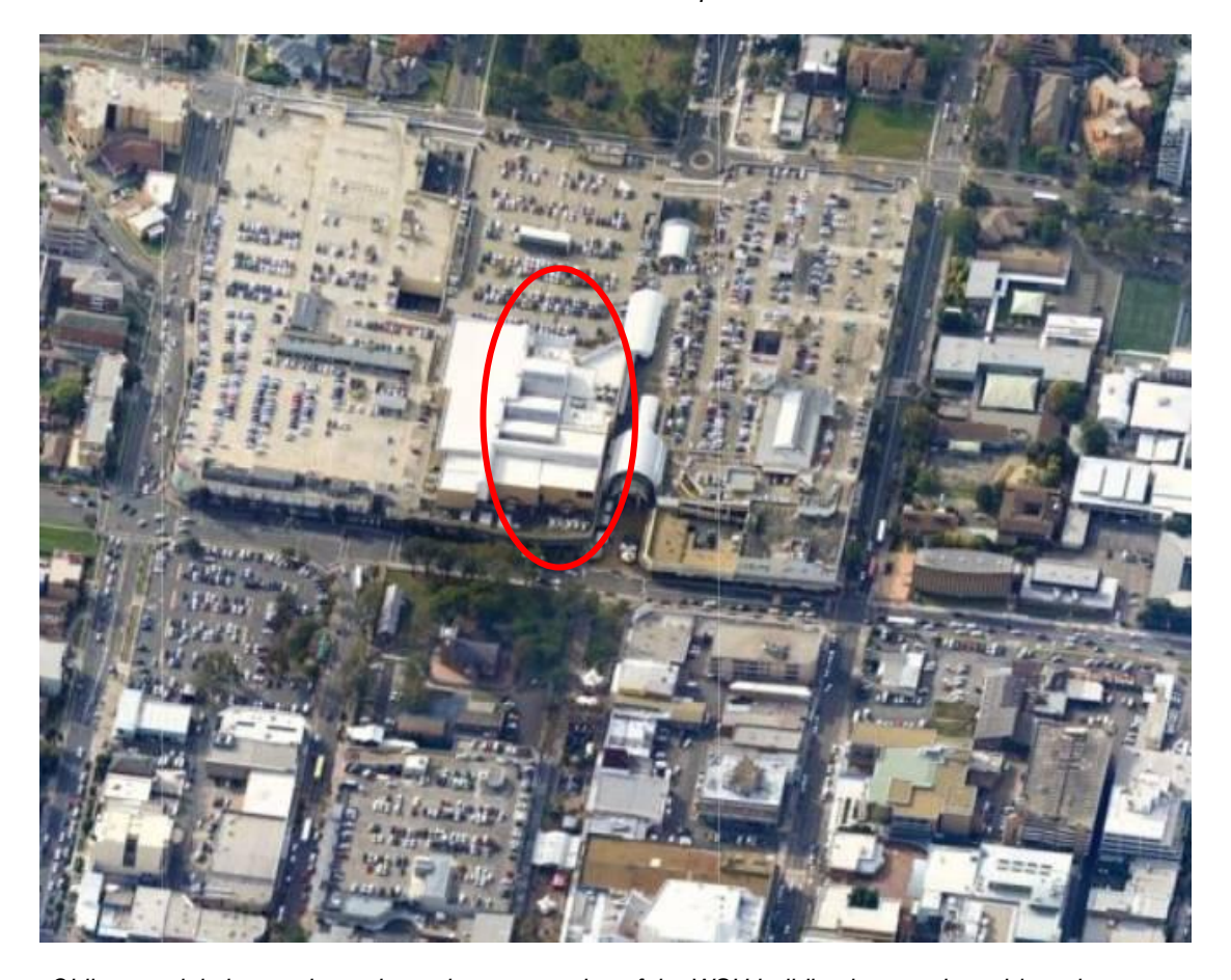
Oblique aerial photo, taken prior to the construction of the WSU building locates the subject site as part of the Westfield Mall